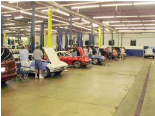
The Judging Field!