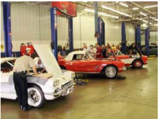
The Judging Field!