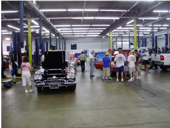
The judging Field