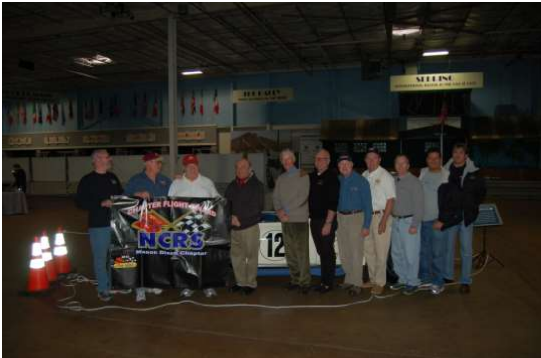
Mason Dixon Chapter and Grand Sport #2