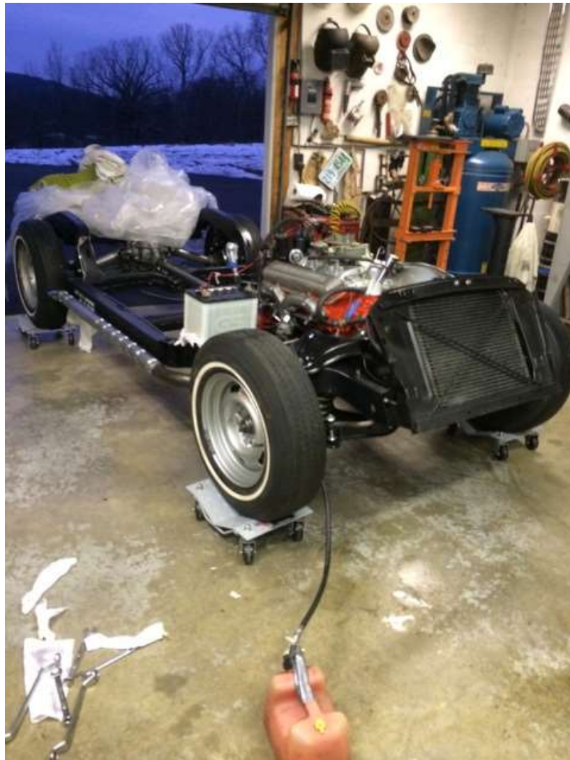
Temporary wiring and cooling for test start up – what a relief!

So it sat from November 7 th until today, November 30 th . I changed the oil and filter and seeing nothing unusual there, I started it again and held my breath. Wow, it ran smooth and sweet. I let it warm up, revved it up, idled it down to nothing. Wow, it ran like a Swiss watch. Maybe I dodged a bullet? I guess time and use will prove that either way.