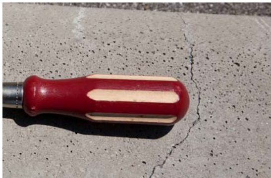
Bolt-On Screwdrivers, Four Styles, Top to bottom. 1. Imprint block style 1 line 2. Imprint block style 2 lines 3. Irwin – Slanted & 2 Size Fonts 4. No imprint and darker paint

Four Screwdriver variations are pictured in Photo 1. Only the two variations mentioned above are believed to duplicate original Screw-Drivers.