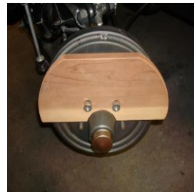
Fig 5. Spring in Position