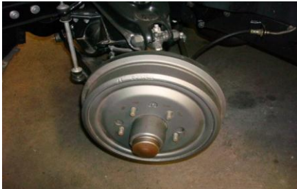
Fig. 1 –C1 53 thru 62 brake drum

I laid the wood out, cut it on a band saw, drilled the two holes and countersink them to use lug nuts.