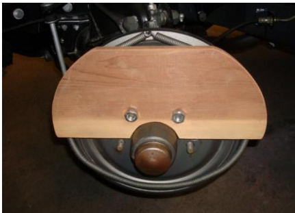
Fig. 2. Jig in Place with Spring