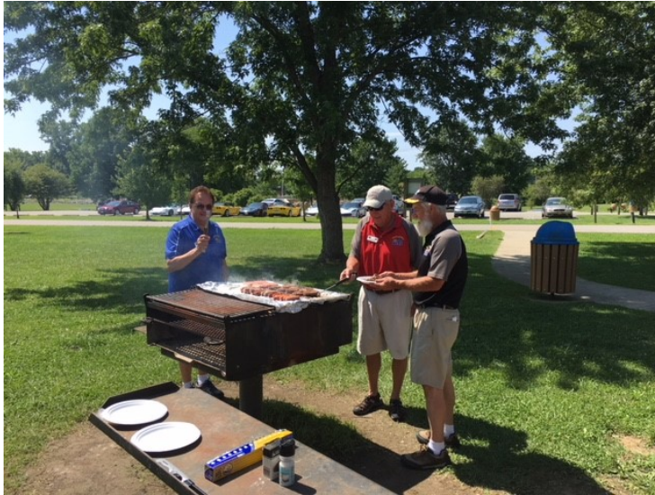
The Crew cooking up the hot dogs and burgers!

Our HoO picnic was held on August 12th, on a beautiful day at Alum Creek State park. The club rented a nice shelter house at the base of the dam. 13 members and families enjoyed a great day.