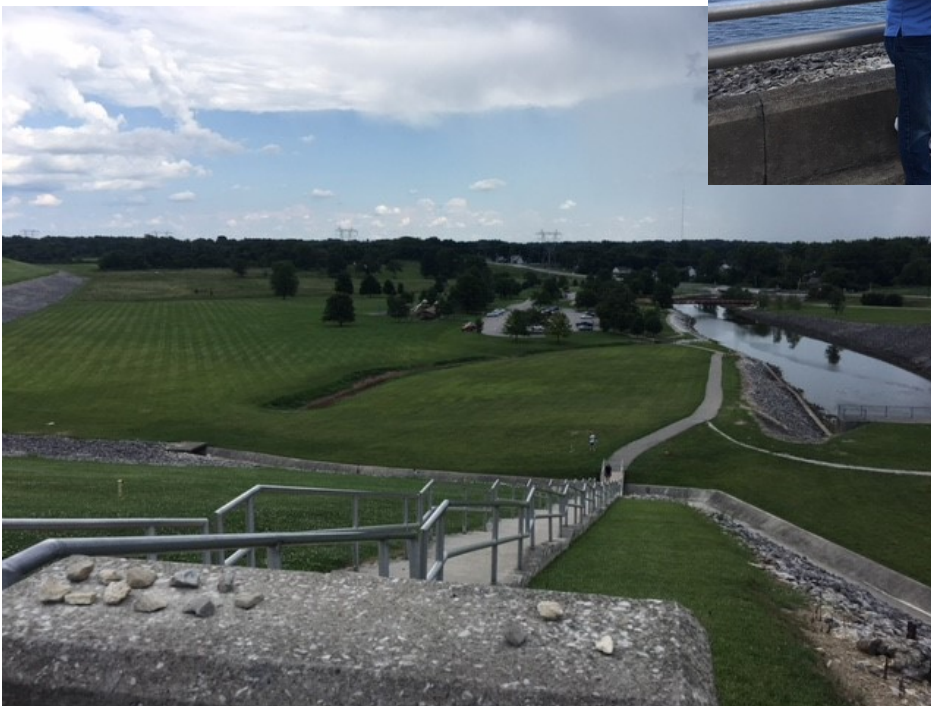
View from top of the dam. Alum Creek State Park.