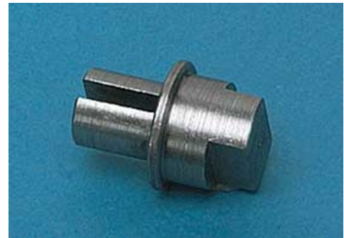
The main assembly rivet above lshows the double D for assembly and the slot that holds the spring that is pictured to the right beside the rivet