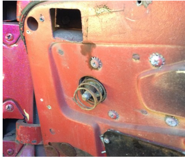
You can see the 4 phillip screws that attach the window regulator to the inner door fiberglass and pictured top is the replacement gear and rivet