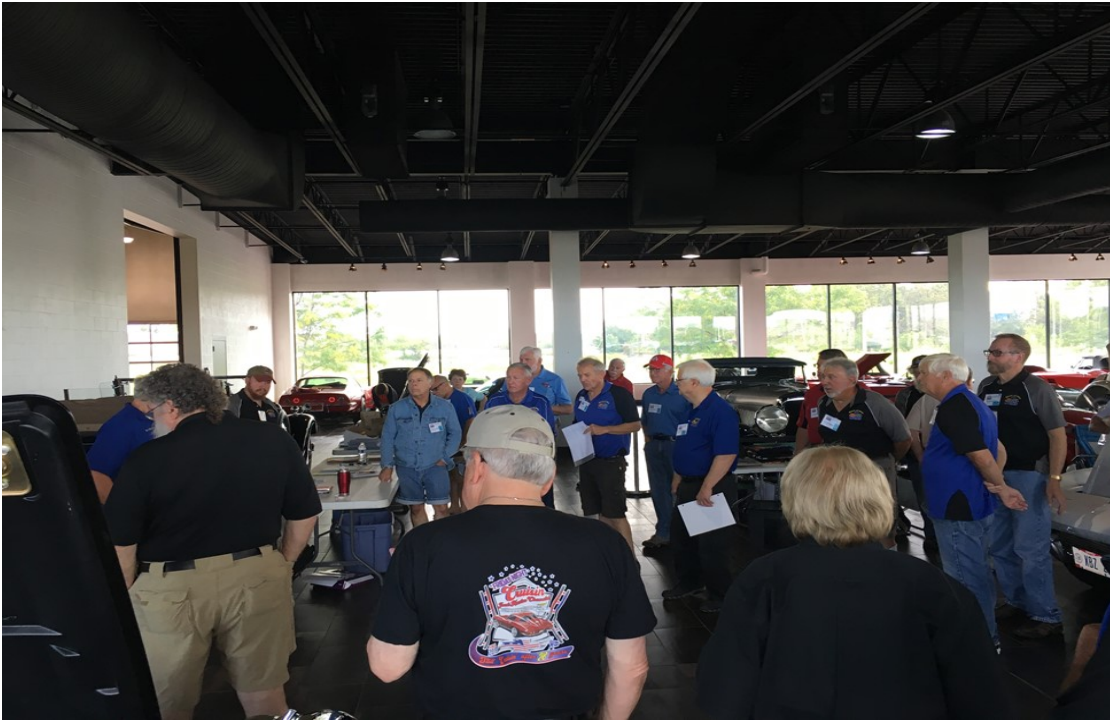
Judges being briefed on assignments.