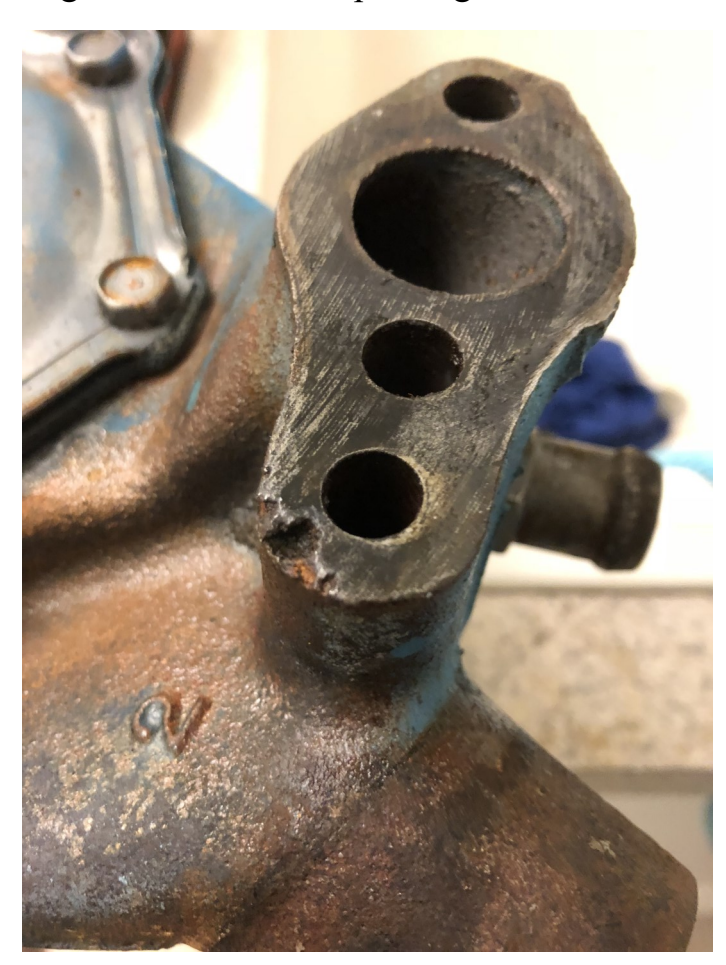
Figure 1. Water pump showing defect

Inspection of the water pump and engine mating surfaces on the passenger side near