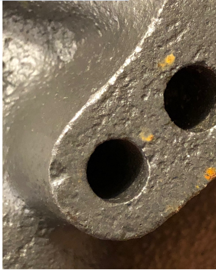
Figure 2. Engine block abnormality

the bypass hole revealed a significant defect in the water pump cast material. Fig. 1. The engine block was intact Fig. 2. This was not felt to be a corrosion issue but more of a casting defect that occured during the water pump manufacturing process. In fact inspection of the sourced replacement pump with a date code approximately two weeks prior showed a similar but less severe area of erosion. Fig. 3.