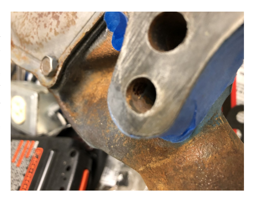
Figure 5. Final repair

Removing the pump is no easy task. It helps if you've had to venture in there a time or two before. Air cleaner and paper elements connected to air intake duct