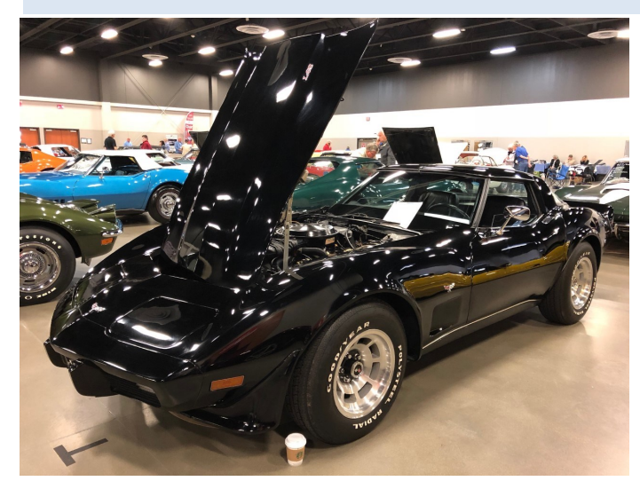
Sharonville Regional 2019

There had been a small drip under the center front of the car. It was just beneath the timing chain, oil pan junction. Presumption was the timing chain cover harmonic balancer seal had a small leak, not unexpected for a 40 year old 45,000+ mile original L82 motor. It was not a problem deemed needing repaired. Then on a trouble shooting drive sorting out other issues at about 5,000 RPM run up a white plume started pouring out from under the hood. Fortunately it didn't have a fire smell but the sickening sweet smell of engine coolant burning off a hot exhaust pipe. Not being far from home and the temp. gauge still in the normal range the decision was made to drive the 2 miles back to the house. At first a hose rupture was suspected. On further evaluation it was found the leak source to be the water pump where it bolted to the front of the engine on the passenger side. The pump was removed and inspected.