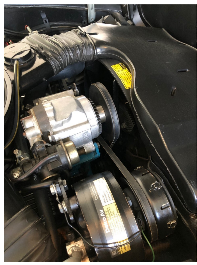
Water pump removed