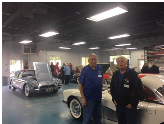
Judging Participants in Action