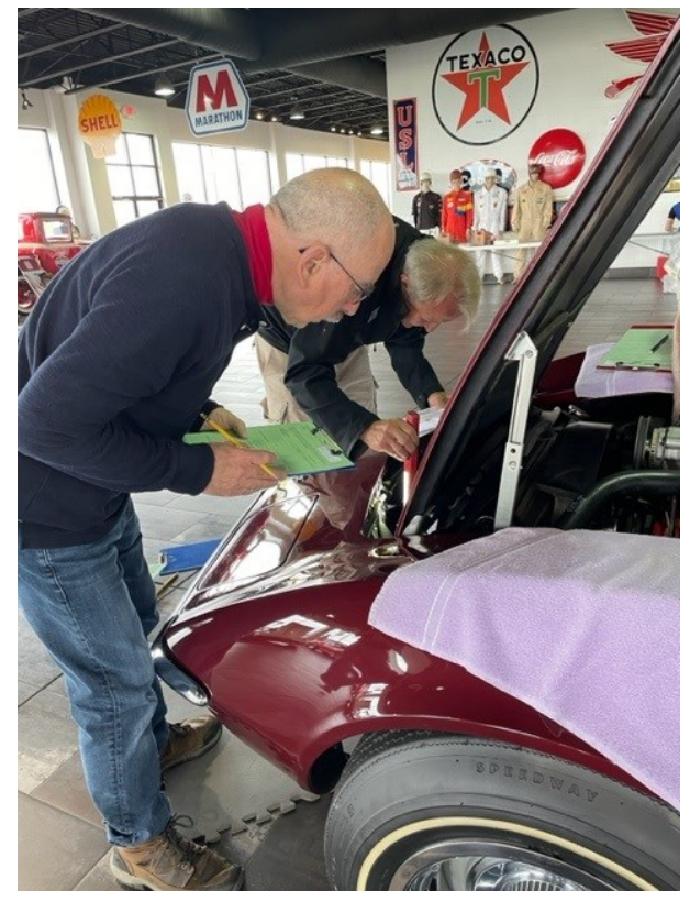
We're on the web ! www.ncrs.org/hoo