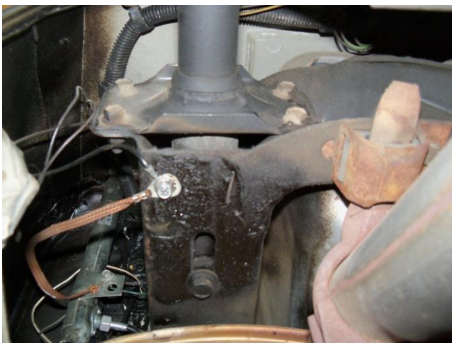
1982 Rear bumper Shock.