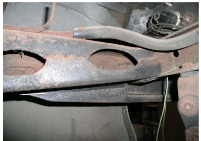
1974 Rear impact bracket.