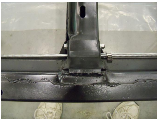
1968-1979 cars with Automatic had bolted cross members.