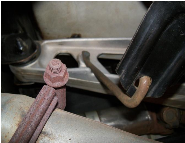
1982 Rear cross member.