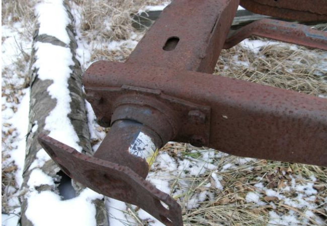
1975 Rear hydraulic bumper.