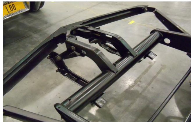
1973 front impact bumper.