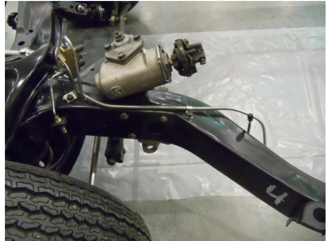
1968 and later auto cars had no clutch shaft bracket.

Mike has done a nice job on documenting the various frame changes on the C3 from 1968-1982.