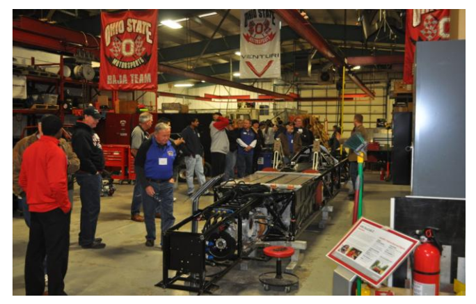
Tour of the Center for Automotive Research. Approximately 25 members attended. Great start to 2016!