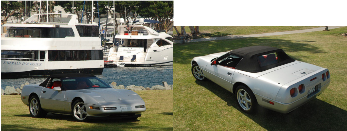
1996 Corvette: Official GM Photo.