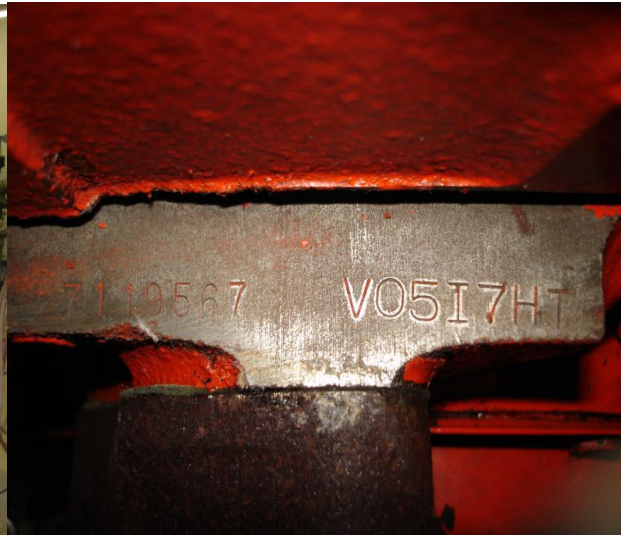
My “Birthday” Car

After hours of body-on resto work and study, this car has become special to me in a couple of ways. Most likely those are reasons why I have owned it the second longest of any of the dozens of vettes that have passed through my hands. My “special” vette has a motor assembly date that is my birthday (month/day) of May 17th. I have never seen another May 17th stamp. PLUS, the VIN number is 19567. Guess what? I was 19 years old on 5 (May) of 67 (1967). I am pretty convinced this car is meant to stay in my garage.