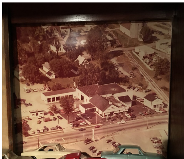
Walters Chevrolet 1970's