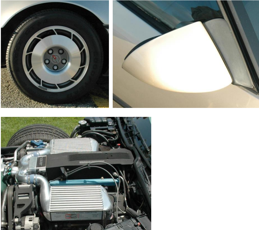
Official 1987 GM Photo

Corvettes have always been prime targets for car thieves, so a novel anti-theft system was introduced for the 1986 'vette. Embedded in each key was an electrical resistor whose value acted like a code. If the car did not read the correct code, starting was disabled and a built in delay prevented a restart attempt for two minutes.