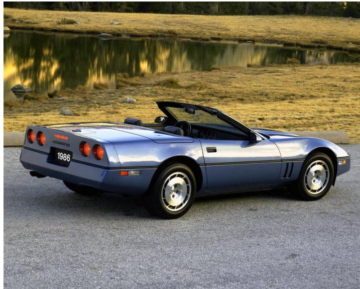
Official 1986 GM Photo

The convertible returned to the Corvette line late in the 1986 model year. This was excellent news and fans of America's sports car were too enthused to wonder why it had been gone for ten years. Open air motoring carried a significant price increase however. The convertible was a $5,000 premium over the coupe and at $32,032 it cracked the $30,000 price point by a significant amount. The Corvette had been getting pricey in recent years. Only two short model years earlier, the 1984 Corvette was $21,800 and except for the '82 Collector Edition Hatchback, it was the first Corvette to cost more than $20,000. With a huge jump in performance and technology via the C4 introduction, the Corvette maintained its lead as the premier performance car bargain. Customers were still plentiful and the sales volume continued at a healthy pace. Perhaps Chevrolet had been underpricing the 'vette all along?