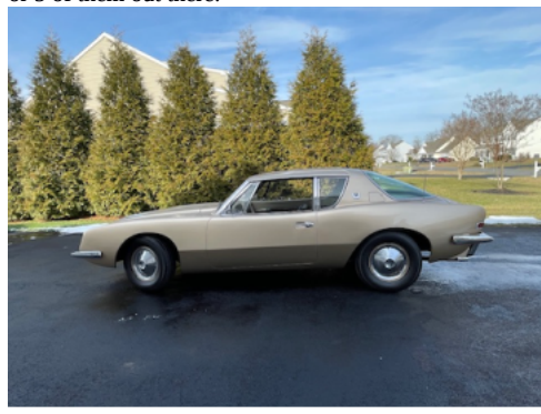
Social Activities Report Steve Lesser

Well its not a Corvette but it is all fiberglass made with Corvette fiberglass! The Studebaker people have no idea what the "B" means. They say there are only 4 or 5 of them out there.