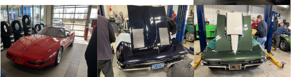
On April 27, 2024 around twenty Mason Dixon members ventured to a private showing of an awesome Callaway collection in Jarrettsville, MD. The following pictures were provided by Rick Aleshire.