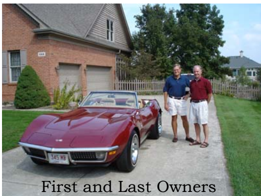
First and Last Owners