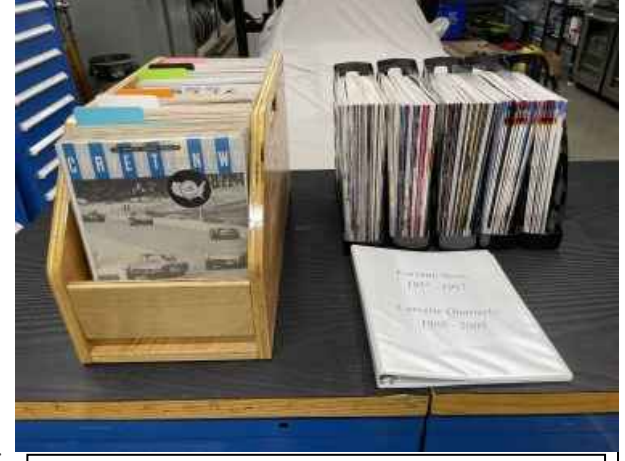
Photo 1 Corvette News (wooden holder) Corvette Quarterly (plastic holders)

When you purchased your new corvette, your owner's manual had a postcard on the front that you sent in with your name and address. You received a pin, a patch, an ID card, and a subscription for three calendar years to Corvette News . It was originally sent out four times a year and later six times yearly.