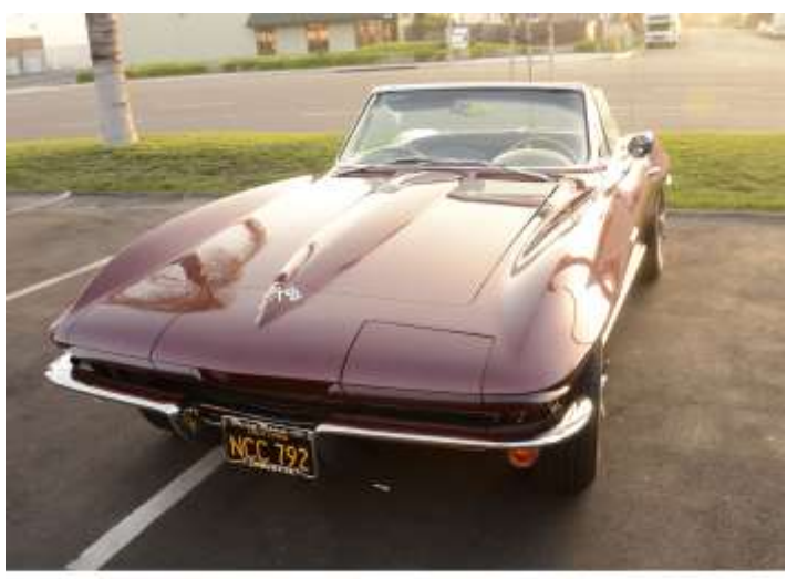
Tony Samojen, 1965 Top Flight