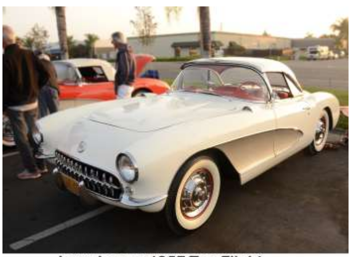
Jerry Louer, 1957 Top Flight