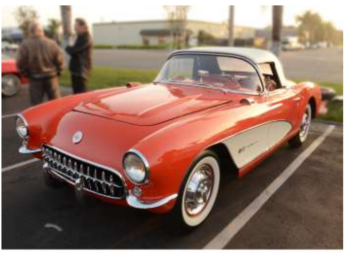
Harold Rodgers, 1957 Top Flight