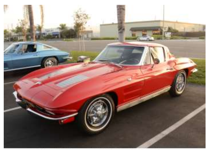
Tim Osborn, 1963 2nd Flight