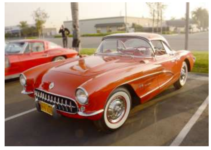
Dennis Pagliano 1957 Top Flight