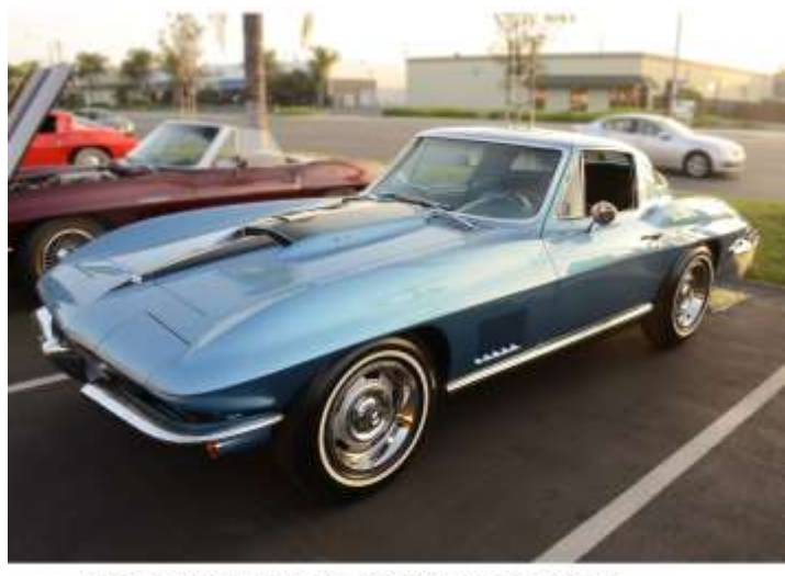
Hector Guzman, 1967 Top Flight