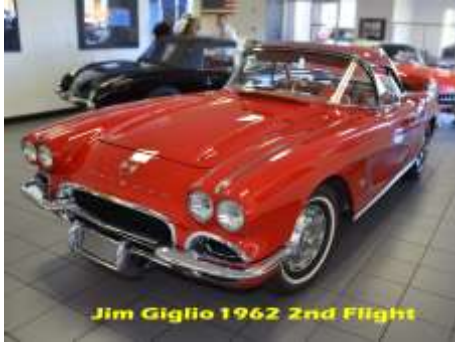
Jim Giglio 1962 2nd Flight