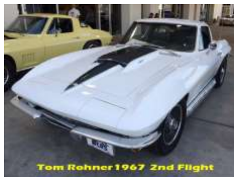
Tom Rehner 1967 2nd Flight