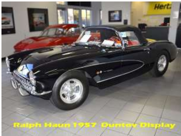
Ralph Haun 1957 Dunton Display