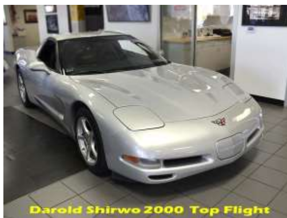
Darold Shirwo 2000 Top Flight