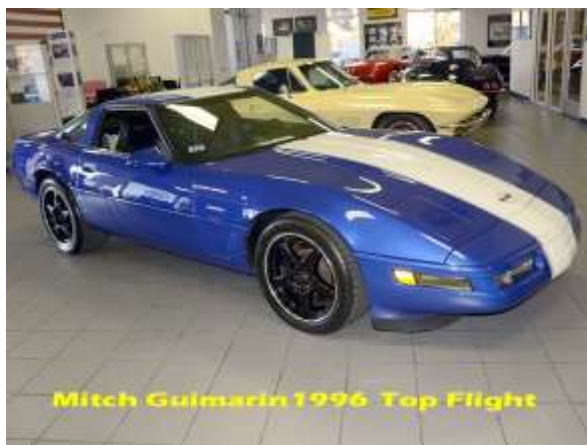
Mitch Gulmarin 1996 Top Flight