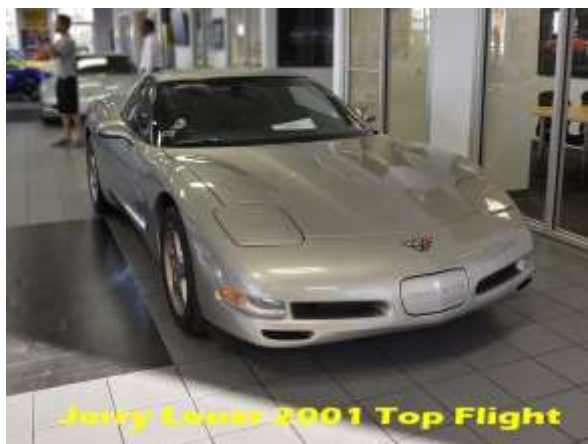
Jerry Louer 2001 Top Flight