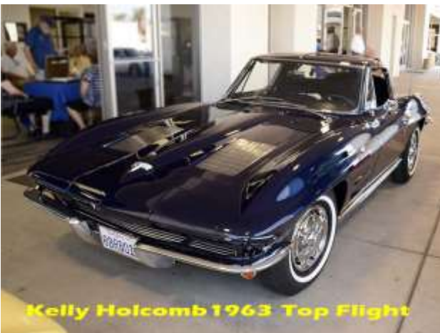
Kelly Holcomb 1963 Top Flight